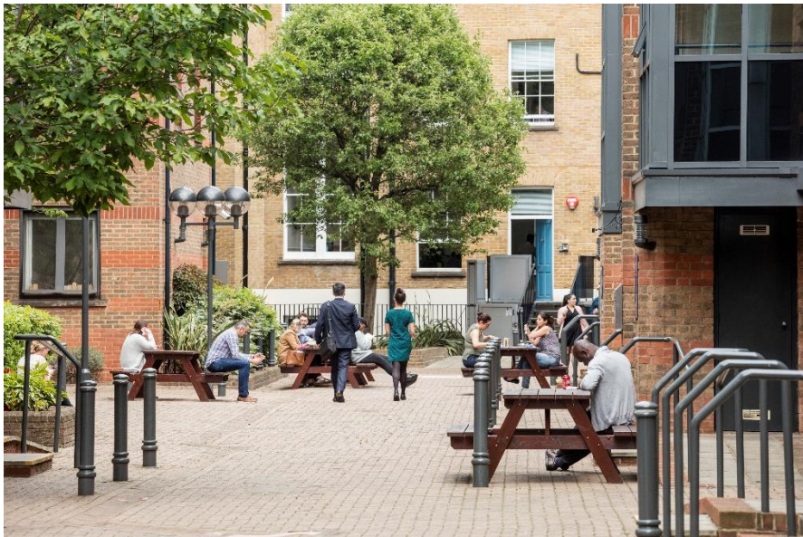
City Road Courtyard