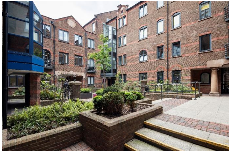
Goswell Road Courtyard