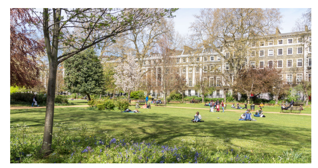
The building sits at the heart of Bloomsbury, surrounded by world-renowned universities, a plethora of restaurants and retail opportunities and lots of green space for some rest and relaxation. The location is also exceptionally wellconnected with numerous underground stations and Euston, King's Cross and St Pancras International moments away.